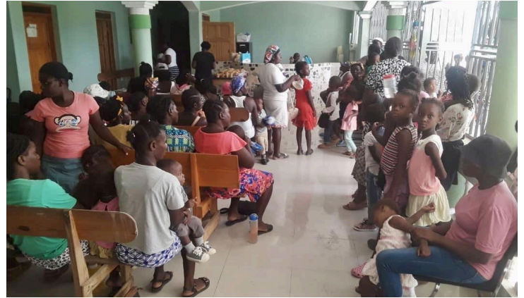
Existing Clinic Waiting Room